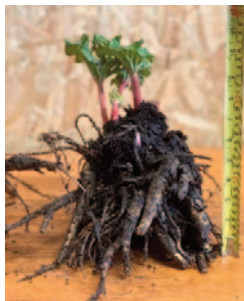
Rhubarb crowns are sold like this, or in pots.